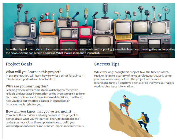
Sample Project Introduction